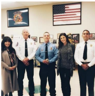
Mission & Programs

In addition to providing financial assistance to families of first responders, The Borderland 100 Club also provides fundraising assistance for first responder families in need, life saving equipment to local departments, and the much needed community outreach that our local heroes deserve.